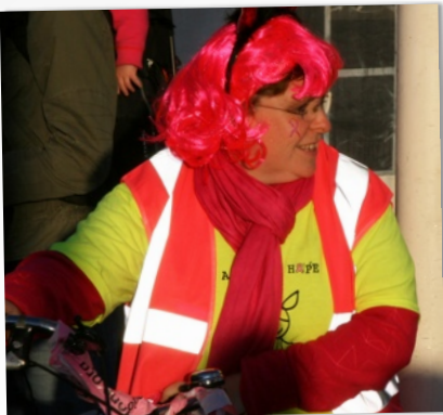
SAFETY & CLEANUP CREW