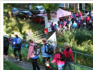
PIT STOP DAY 2