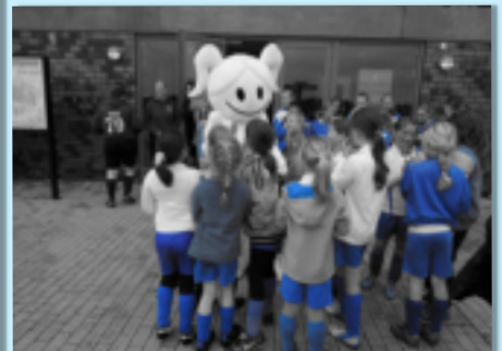
DESTO GIRLS AND WOMEN'S SOCCER TOURNAMENT IN UTRECHT PROMOTING A SISTER'S HOPE ON MAY 18